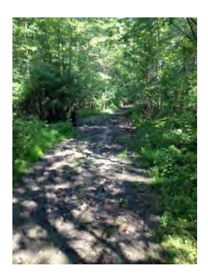
End N42.4930 x E76.8078 (looking south)