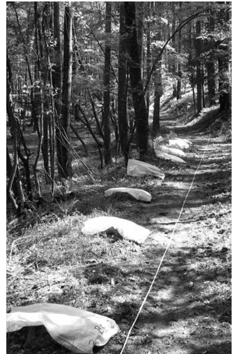
A transect containing the hay, manure, and hoof debris samples collected from 20 horses participating in the Biltmore Estates Challenge endurance ride in 2005.